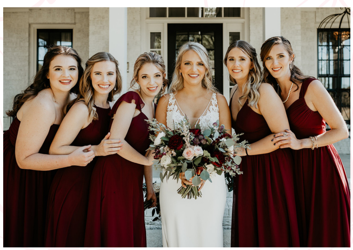
FOR MORE INFORMATION PLEASE SUBMIT A BRIDAL INQUIRY FORM TO RECEIVE MAKEUP BY ASHLEY'S FULL BRIDAL BOOKING GUIDE